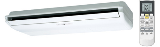
ABTA36/45LAT / ABTG54LRTA